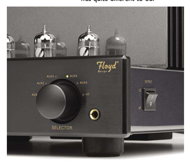
At right a full sized 1/4in (6.3mm) headphone jack with rocker switch behind to silence the 'speakers.

Creek, that came across as softer and less forceful.