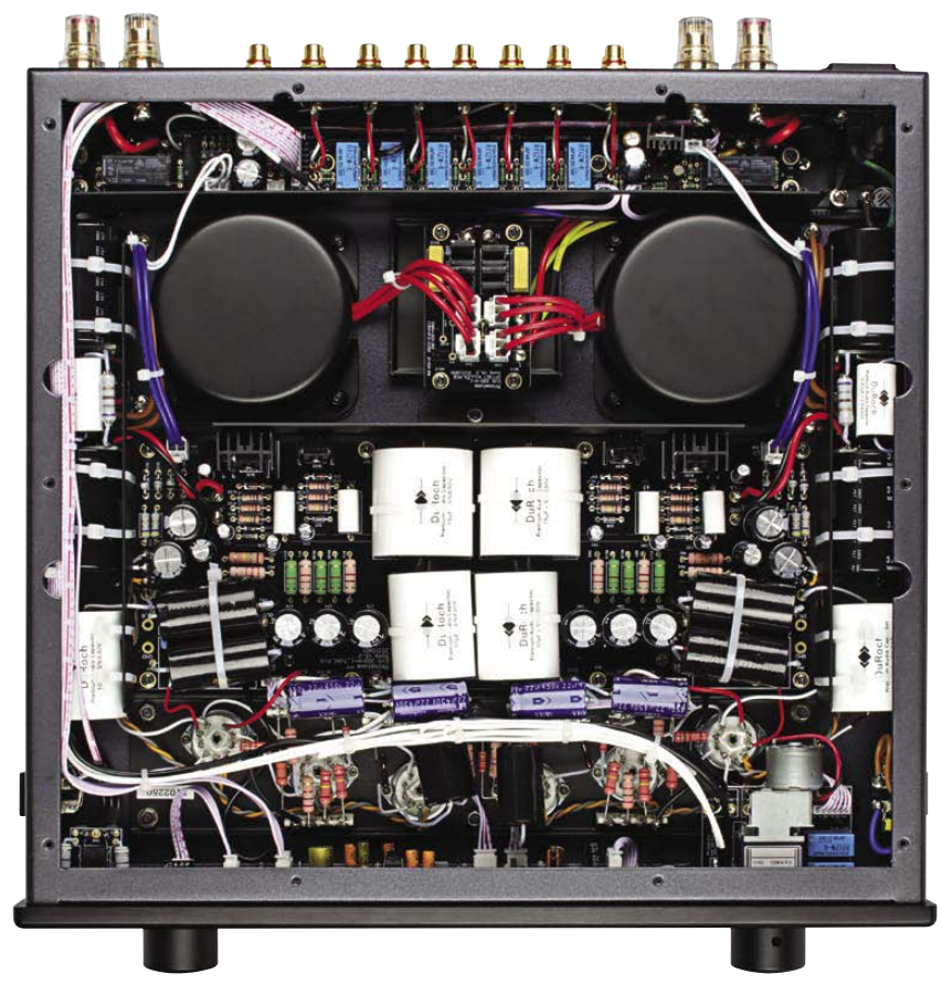
The inputs are selected by relays (top) and the two mains transformers for preamplifier are screened toroidals. There are specialised (white) capacitors and a motorised Alps volume control (bottom right).

This is an amplifier with a characterful sound that was easy enough to sort out. As you would hope from a well developed MOSFET amplifier with big linear power supply there was superb dynamic contrast making for a meaty sound. I found it added muscle to whatever was connected, livening up a pair of Focal K2 906 loudspeakers under review, for example. With well lit, detailed treble in typical MOSFET fashion the EVO 300 Hybrid came across as having an airy, open wideband delivery that added sparkle to highs: this is not a warm sound and was quite different to our