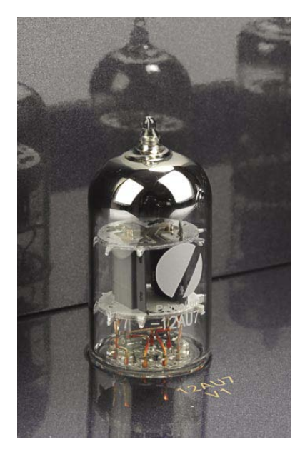
A 12AU7 double triode; six valves/twelve triodes in all are used. Typical life time is 10,000 hours and they are inexpensive.

where John McVie's bass line similarly made its presence well known in the room. It's this low frequency heft that gives the amplifier its muscular sound. Bearing in mind valve amplifiers have big bass, if obviously softer bass than transistor amplifiers, and you get a satisfying amalgam here that's the best of both.