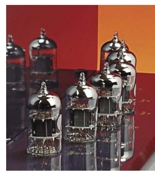
A rank of 12AU7 double triode small signal valves handle preamplification (2) and phase splitting/buffering (4).

With bass heavy tracks, like Giorgio by Moroder from Daft Punk (24/96), this amplifier had both grip and heft, as it did with Fleetwood Mac's Dreams (24/96)